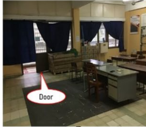
The photo takes from back-corner (left-side)