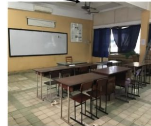
The photo takes from back-corner (left-side)