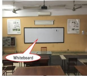
The photo takes from back-side